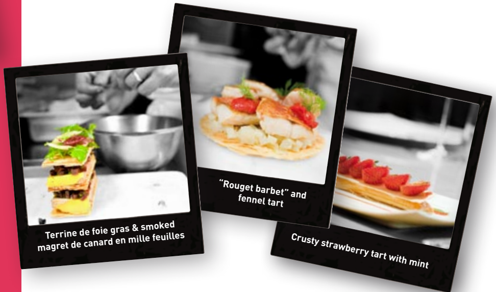
Terrine de foie gras & smoked magret de canard en mille feuilles

Discover the full product portfolio of dough and finished products by Maitre André on www.maitreandre.co.uk